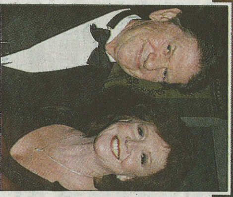
Philanthropist: Reading FC boss John Madejski with his partner Cilla Black